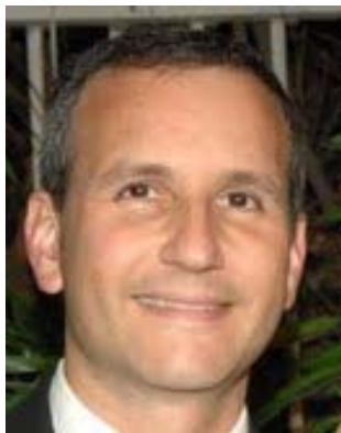
Chief Medical Officer, Vicor Technologies, Inc.