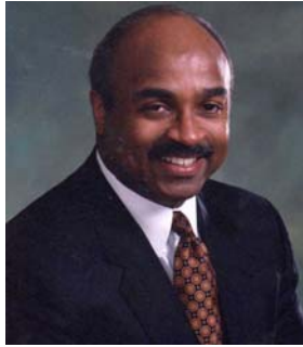
President of the American College of Surgeons, (ACS)