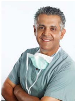
Professor of Surgery Chair in Minimal Invasive Surgery & Surgical Innovation McMaster University, Canada.